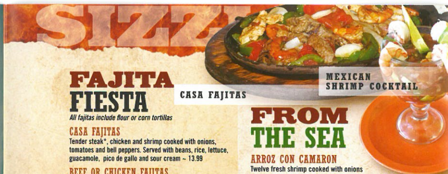
MEXICAN SHRIMP COCKTAIL