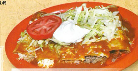
ENCHILADAS SUPER RANCHERAS

Order of two chicken burritos, deep-fried. Topped with lots of melted cheese and served with rice ~ 8.49