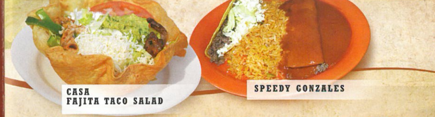
CASA FAJITA TACO SALAD