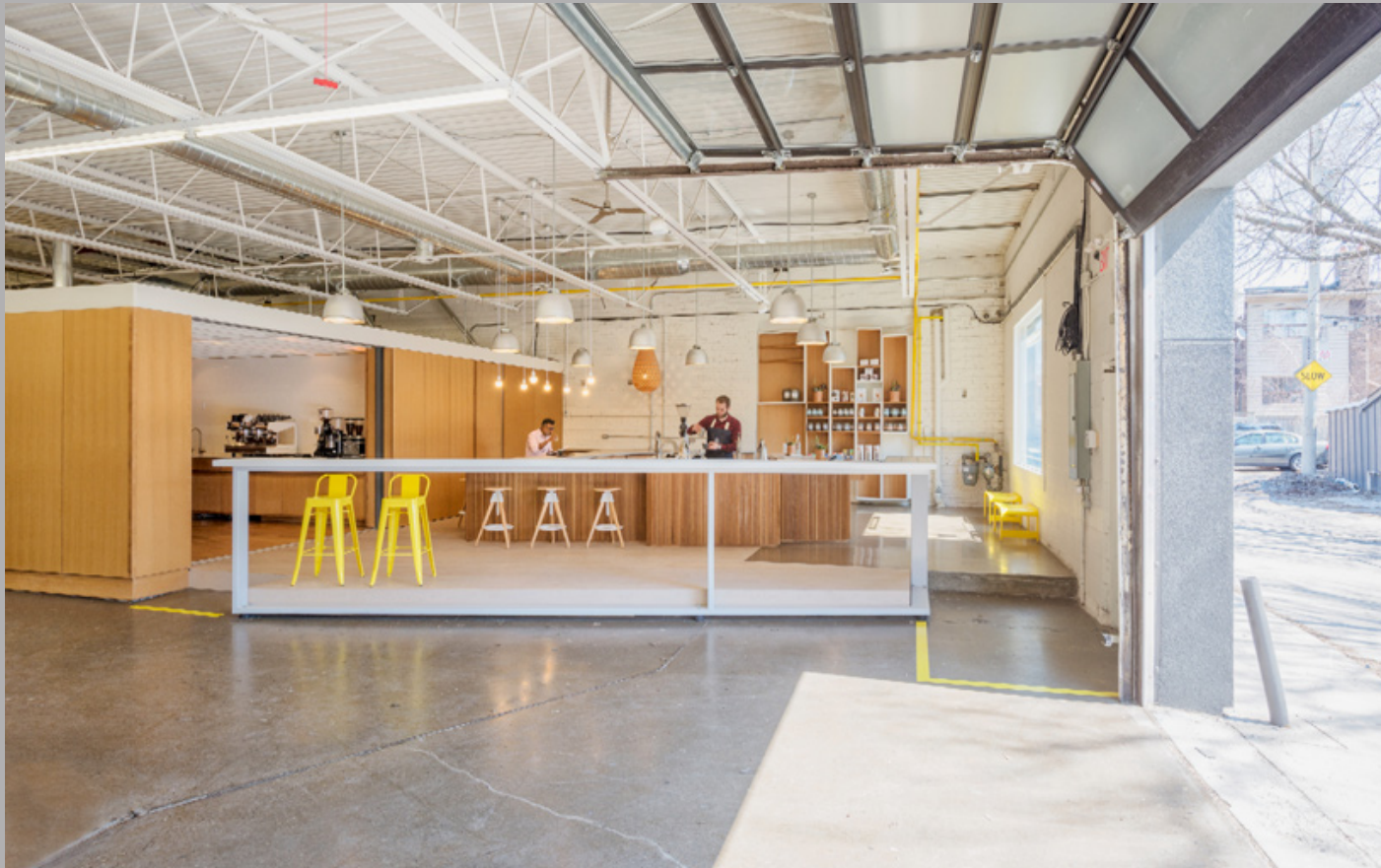
GearBox: Muncie Interior