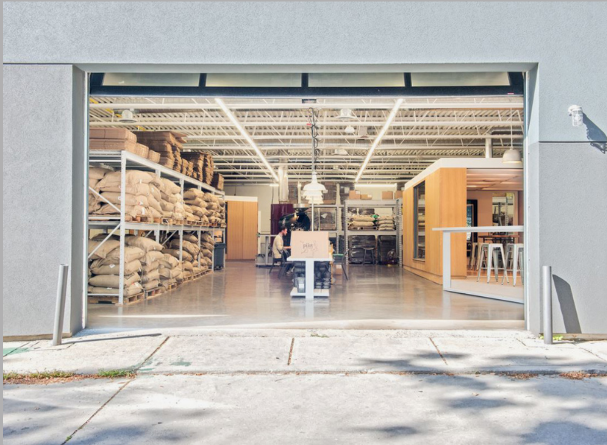
GearBox: Muncie Interior